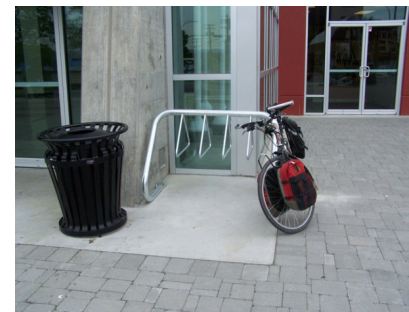
This rack adjacent to the main entrance is operating at less than 40% of its capacity, crowded by the garbage can.