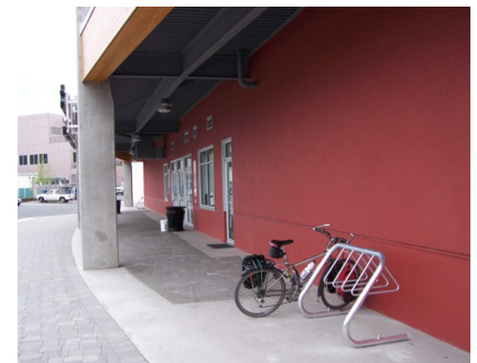
Racks near the community entrance benefit from opportune weather protection but are only accessible from one side. All racks observed are placed against walls, cutting capacity by at least half.

More information on bicycle parking, illustrations of best practices and other site audits will be posted to the CBWS website.