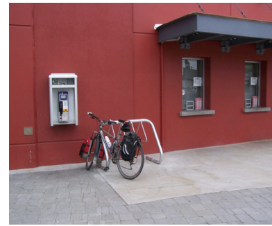
The rack at the main ticket booth crowds a phone booth, (now removed), and is inappropriate in this high traffic area.

The city of Victoria's Bicycle Master Plan (1995) objective on bicycle parking is "to provide secure bicycle storage and other necessary supporting facilities at major destinations.