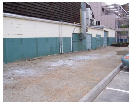
Secure, weather protected bike racks are planned for this area