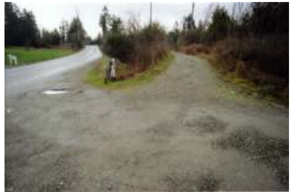
5061 West Saanich Road

Busy trail road intersections will also be candidates for apron treatments. This location is along the proposed Interurban rail trail. While the trail will not be paved in the short term, paving at crossings is recommended.